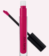
LIP GLOSS $18