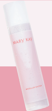
MICELLAR WATER $18