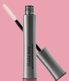
WATERPROOF MASCARA $16