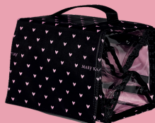
TRAVEL ROLL-UP BAG $36