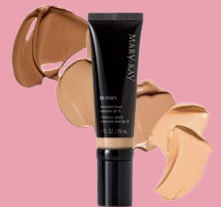
CC CREAM $22