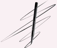
WATERPROOF EYELINER PEN $18