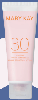
MARY KAY 30 MINERAL FACIAL SUNSCREEN BROAD SPECTRUM SPF 30 MINERAL SUNSCREEN $28