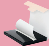
OIL-ABSORBING TISSUES $8