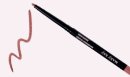
WATERPROOF LIP LINER $14