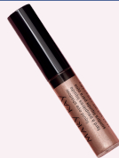
LIQUID EYE SHADOW $16