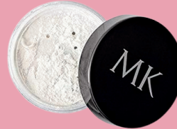
TRANSLUCENT LOOSE POWDER $18