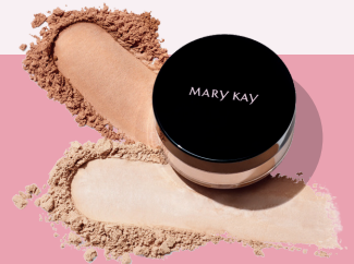
MARY KAY SILKY SETTING POWDER $20